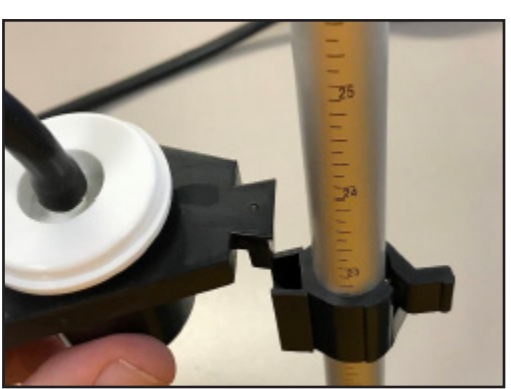
THREE Now, place the pole into the opening at a slight angle.