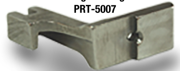
Gathering/Shirring Foot PRT-5007

The Shirring Foot gathers one layer of fabric quickly and easily.